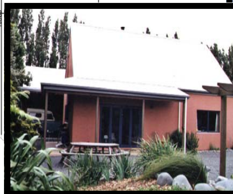
Plans copyright to Cornerstone Eco Homes Ltd ©